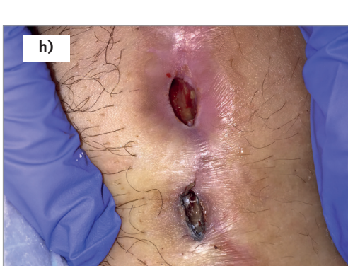
Phtotographs courtesy of: Figure 1a) Jacqui Fletcher; 1b), 1e), 1f) Risal Djohan; 1c), 1g), 1h) Caroline Fife; 1d) Franck Duteille. Reproduced with permission of WUWHS.